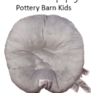
Pottery Barn Kids